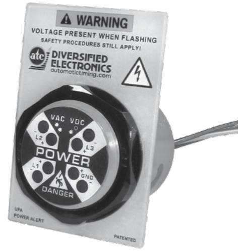
Universal Power Alert